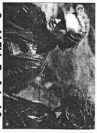
Could This Be Aztech?